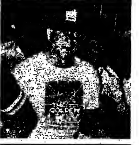
ARRESTED: Barbados police escort the allegedly Ronald Biggs who remained outside of the British police chutes for over 15 years. They took him off the yacht Nowcani II which was towed into Bridgetown Harbour by a Barbados defense boat in Monday night. Bottom picture shows the Barbados Defense Force vessel proceeds the yacht Nowcani II on its way to the Bridgetown harbour.

the trade unions, Mrs. Williams added: "For the first time in Britain a party will be breaking with all the major interest groups." The SDP is accused by the two major parties of trying to be all things to all people and woolly on policy. As if to counter this, the new party announced a generalized 12-point platform. It urged a mixed economy and more positive efforts toward fairer wealth distribution, while avoiding Labor's latest plans for widespread nationalization. It also will promote women's and ethnic minority rights. On foreign policy, the SDP, which describes itself as left-of-center, is close to the Conservatives. It favors continued membership of the 10-nation European Economic Community, generally unpopular among British voters, and a strong British role in the NATO Western alliance. It also wants multilateral nuclear disarmament, not British unilateral disarmament as officially sought by the Labor Party. Meanwhile, the Labor Party has called on the defuncting members to resign their seats in the House of Commons, but under British electoral law they need not do so.